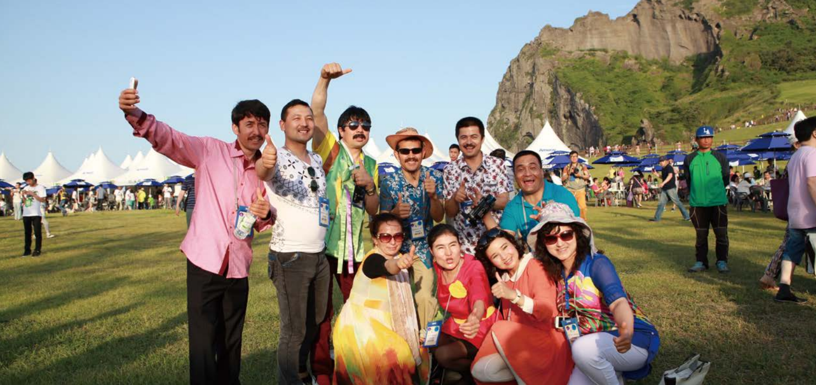
Climbing Seongsan Ilchulbong and watching a performance on Jeju Island

The sunset seen from Seongsan Ilchulbong is one of the top ten beautiful scenery of Jeju Island and Seongsan Ichulbong represents a UNESCO World heritage site. Amway staff members had the opportunity to taste various specialty foods unique to Jeju Island at the booth set up in Seongsan Ilchulbong Square and enjoyed a welcome concert by Little Psy including traditional Korean music and dance performances.