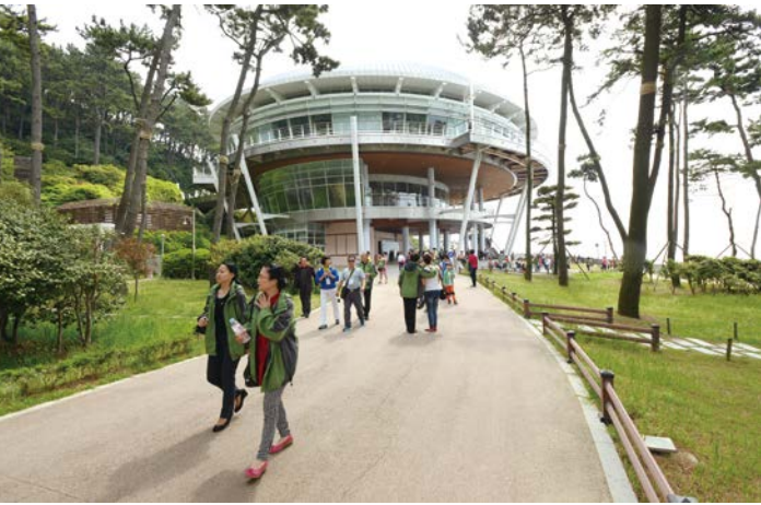
Nurimaru APEC House