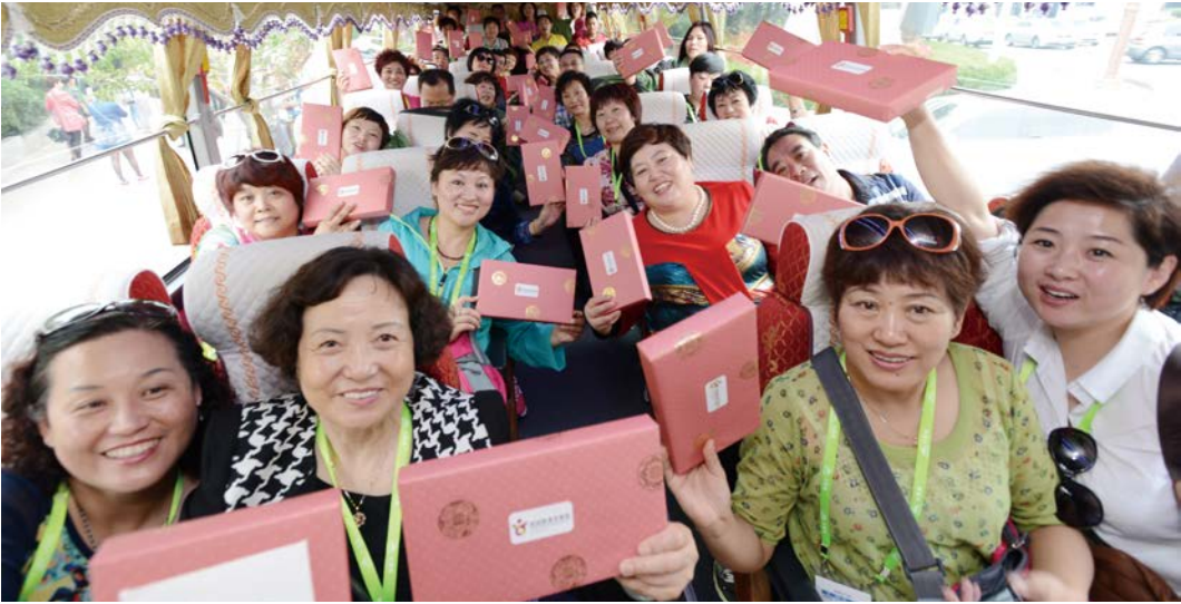
Souvenirs, such as postcards and spoon sets, provided as free gifts