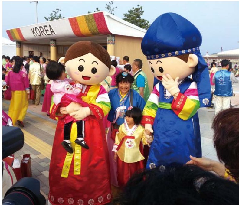
Korean tour information booth