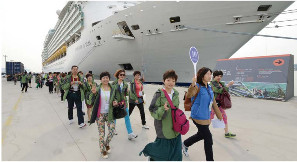
Arrival at the Busan International Cruise Terminal