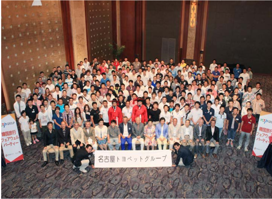
Souvenir photos being taking at the welcome event

Activities: Gala dinner and VIP reception events