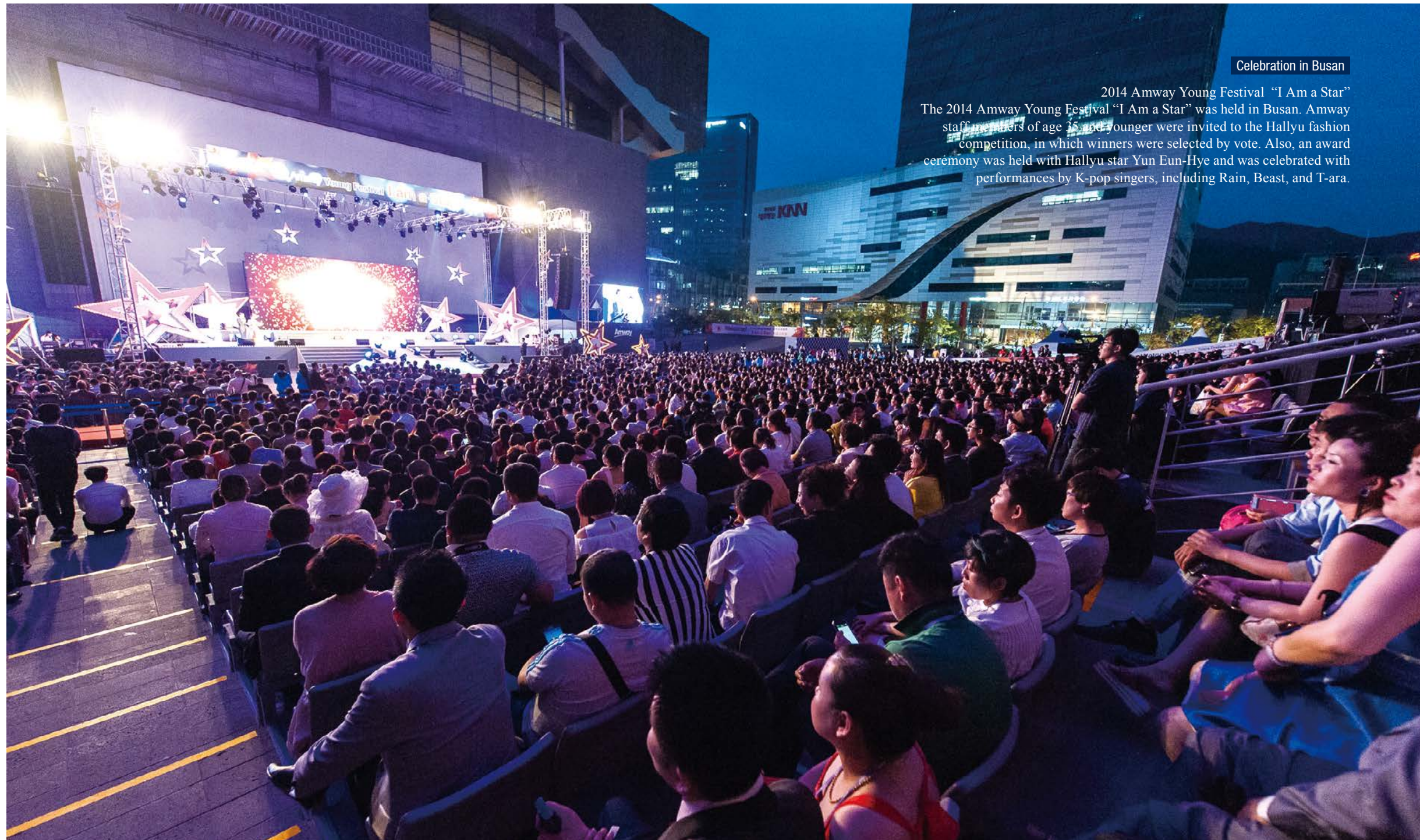
Celebration in Busan

2014 Amway Young Festival "I Am a Star" The 2014 Amway Young Festival "I Am a Star" was held in Busan. Amway staff members of age 35 and younger were invited to the Hallyu fashion competition, in which winners were selected by vote. Also, an award ceremony was held with Hallyu star Yun Eun-Hye and was celebrated with performances by K-pop singers, including Rain, Beast, and T-ara.