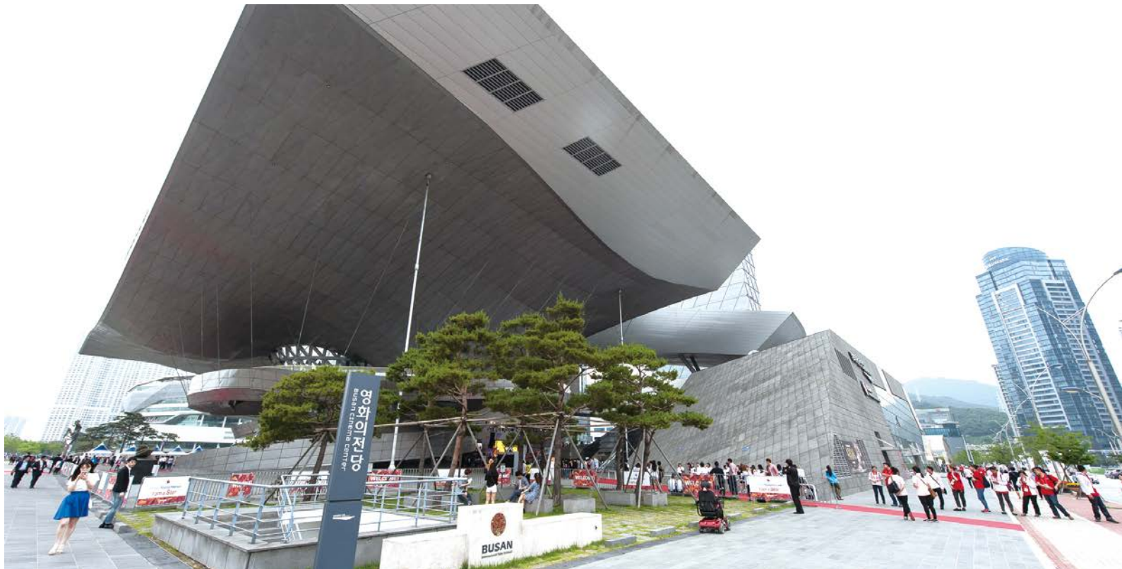
Busan Cinema Center

Busan Cinema Center's Centum City is a work of art with outstanding structural beauty that captures the architectural aesthetics of deconstructionism. It is a cultural complex that serves as the venue for the opening and closing ceremonies of the International Busan Film Festival.