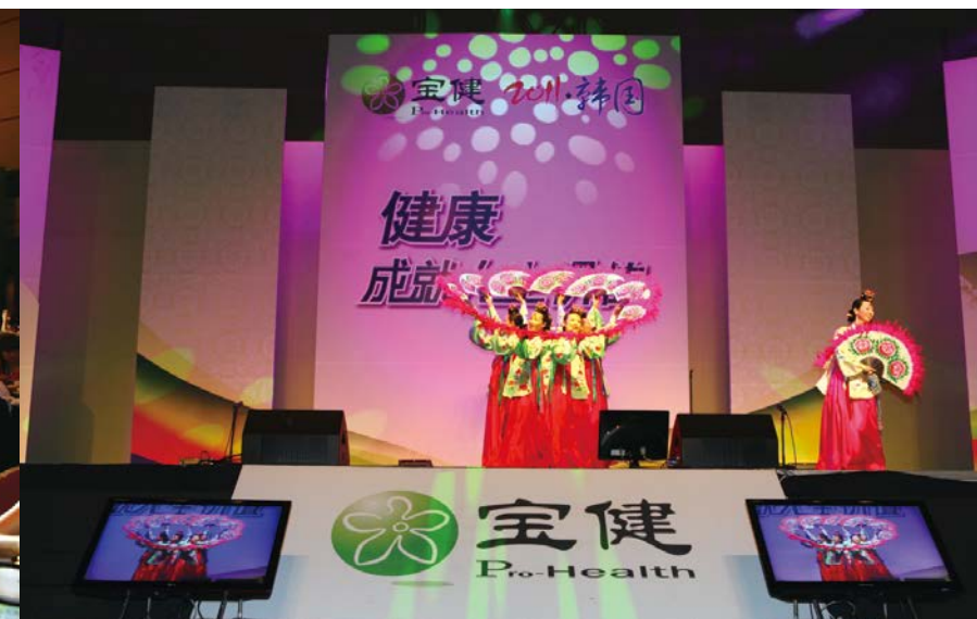
Photo taken at Everland Amusement Park in Yongin