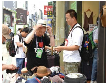
Shopping on a street in Nampo-dong

Busan Cinema Center's Centum City is a work of art with outstanding structural beauty that captures the architectural aesthetics of deconstructionism. It is a cultural complex that serves as the venue for the opening and closing ceremonies of the International Busan Film Festival.