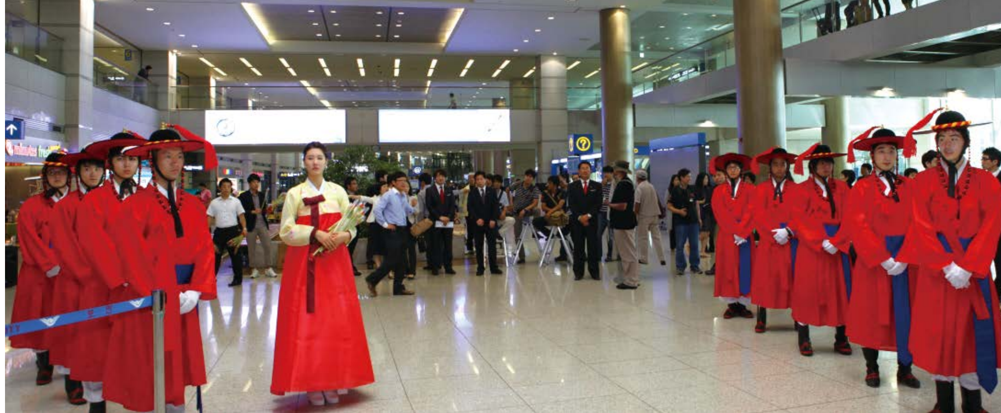
Greeting at Jeju International Airport

Activities: Commemorative events on Baojian Street in Jeju Island, attendance of the Jeju Conference, and visits to various tourist attractions in the metropolitan area.