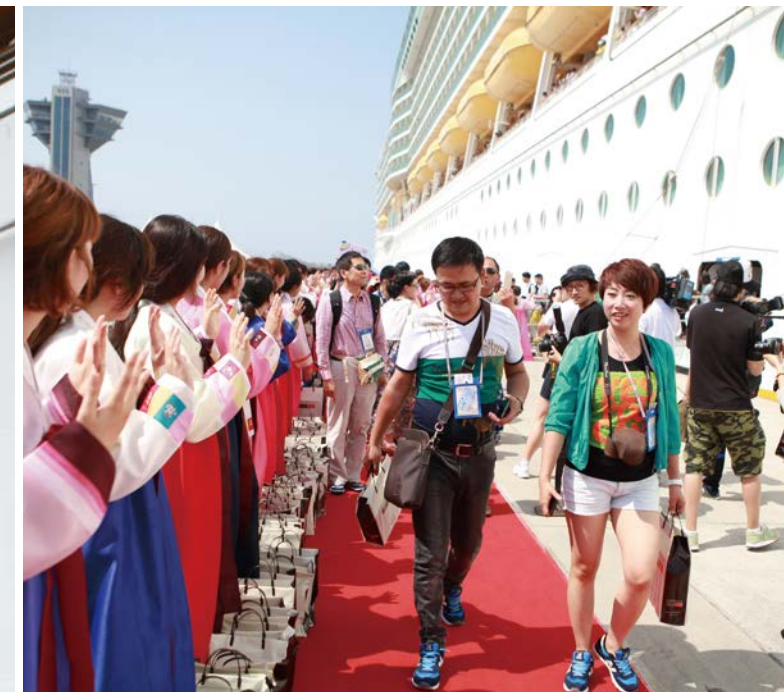
Welcome event to celebrate arrival at Jeju Port

A welcome event featuring a traditional Korean music band performance, traditional music performance, and traditional percussion band were held to greet executive members at Jeju Port.