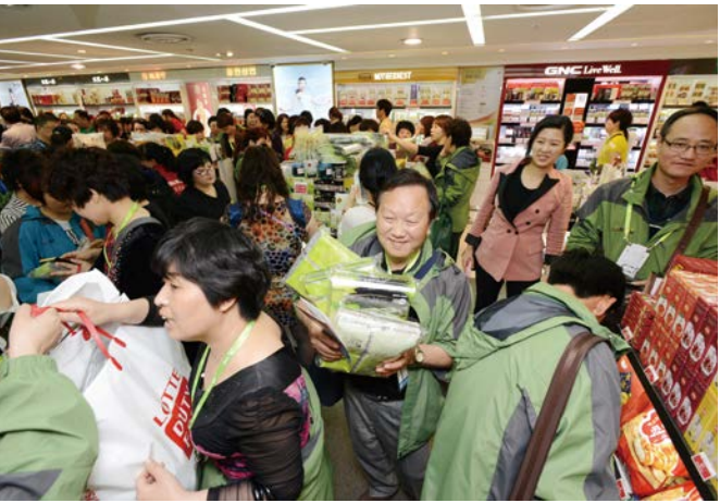
Shopping at the Lotte Duty Free Shop in Busan